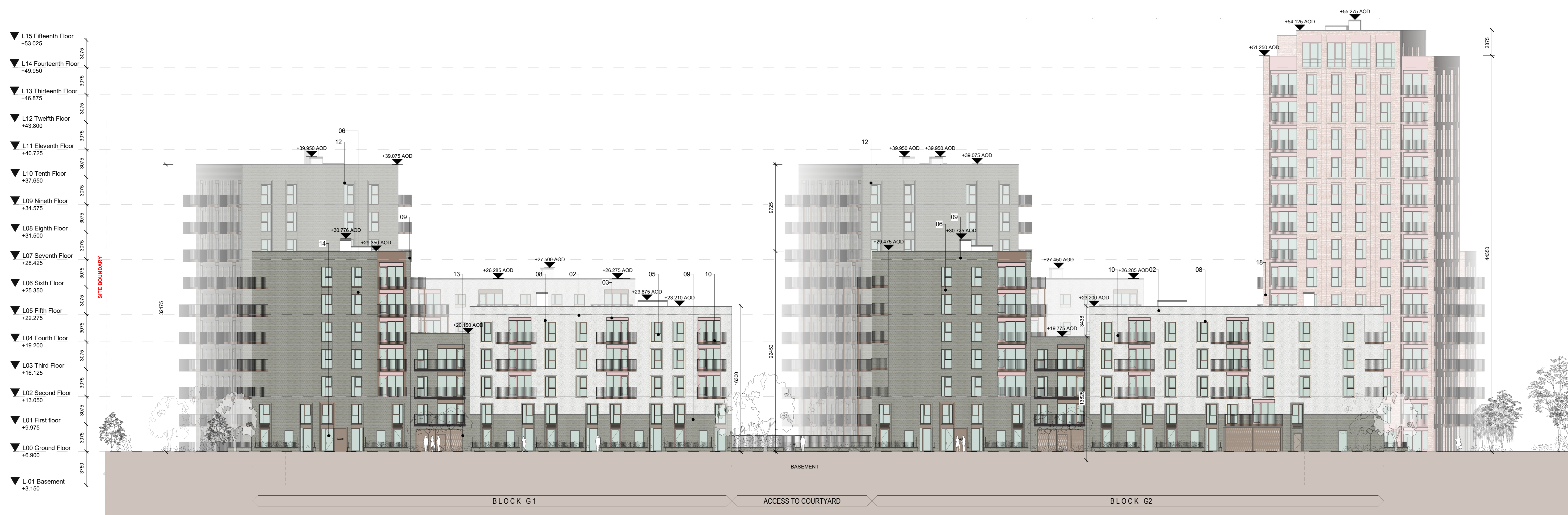
2 Elevation - South 1 : 200